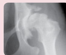
X-ray of an arthritic hip joint in a dog. The symptoms of arthritis are often much worse in overweight pets.