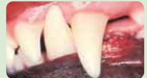
(1) Healthy mouth