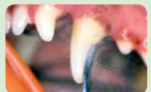
Removing the calculus using an ultrasonic scaler, followed by polishing the teeth is a very effective form of treatment