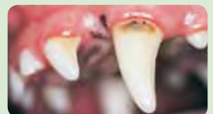
(2) Gingivitis – with early calculus