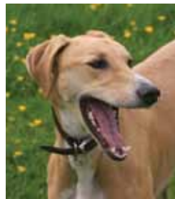
The progression of gum disease in pets

Unfortunately once a tooth becomes loose, the problem is usually too advanced to save that tooth. However if gum problems are identified at an earlier stage, a combination of a Scale and Polish and ongoing Home Care can make a real difference to your pet's oral health (and also their breath!). Please contact us today for a dental check-up!